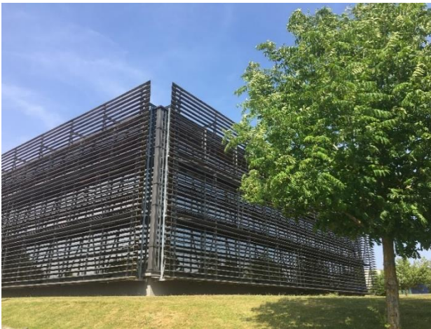
Current ESTP Paris Campus in Troyes